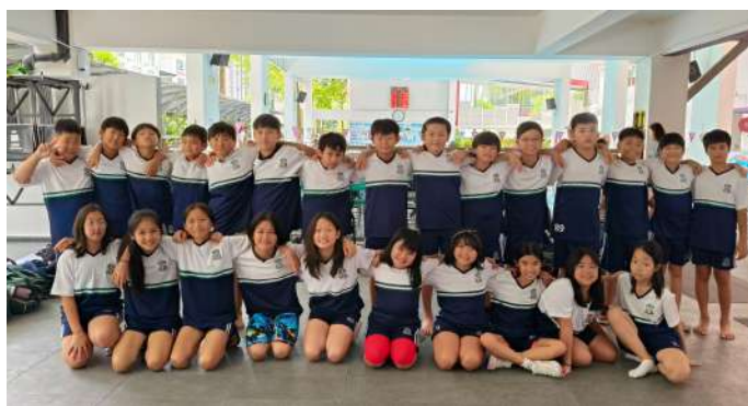
Year 5-6 Swimmers

Our Swim Team had a 3 day friendly meet with ISP where our Year 7-9 swimmers raced on Monday, Year 5-6 swimmers raced on Tuesday, and our young Year 3-4 swimmers raced on Wednesday. The races were intense as the events went by swiftly and our swimmers gave their best effort race after race. It is nice to see how competitive they were sitting on their chairs ready to race one another, and then supporting and celebrating each other after their swim. Well done swimmers for your new Personal Best times!