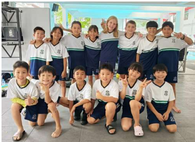
Year 3-4 Swimmers