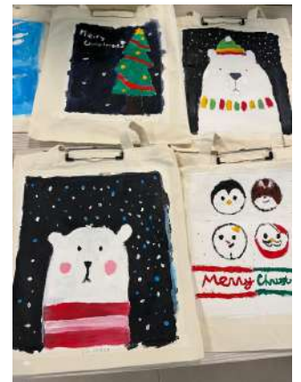
Tote bags in year 4 and 6