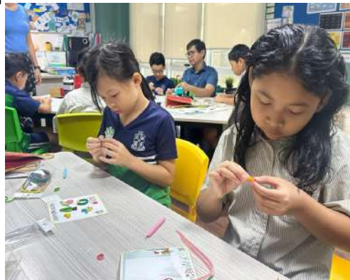
Quilling in year 5