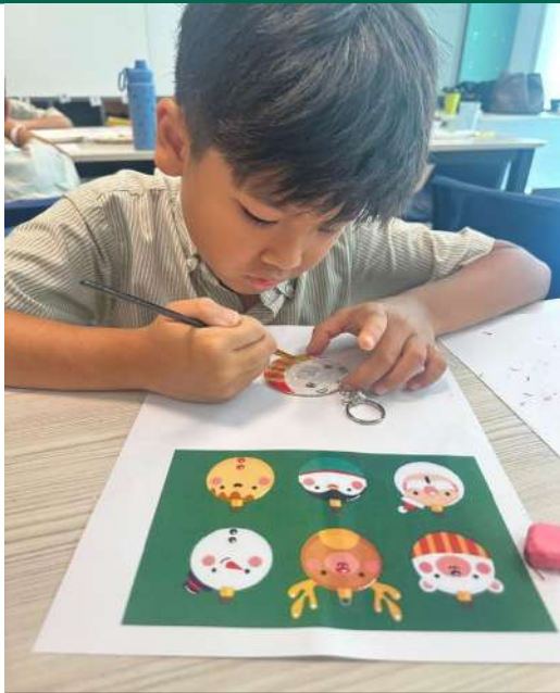
Keyring crafting in year 3