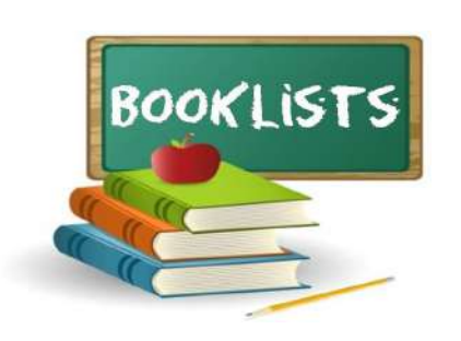
Order Online Guide Tekbookmart App ES Booklist 2024/2025 HS Booklist 2024/2025