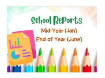
Parents Portal (For ES)