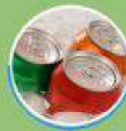
School Perf. Refreshments