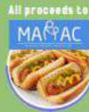
Founders Day Picnic

Thank you To all parents and students who have supported us!