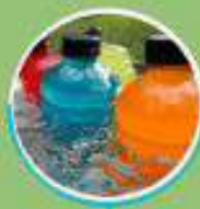
Sports Day Refreshments