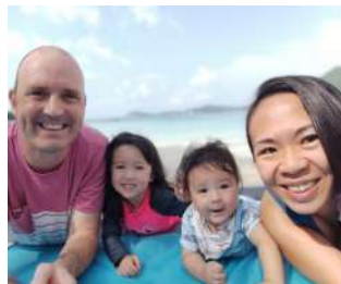
On our most recent trip to the Perhentian Islands