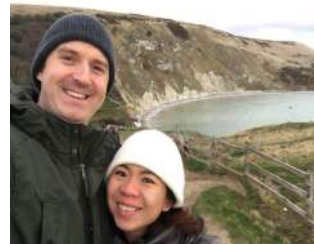
At the Dorset coast