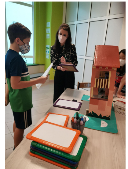
Right photo: This photo was taken yesterday during a Year 6 Exit Point for IPC. Where students from Year 6 visited the Year 4 students to present their electricity projects. Even I was quizzed on my knowledge!