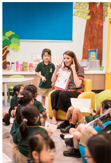
Left photo: This was taken the morning the doors of SJIIM officially opened. I was so excited to meet my new students, I had very little sleep the night before!

As the years have passed (so quickly) I have seen people come and go, overcome obstacles, experienced life as an online teacher during a pandemic but two things remain constant for me; my faith in the school and the enjoyment of working in a values driven environment. This in turn has enabled me to develop as a practitioner, and I can now look through the dining hall windows to see my own daughter playing happily with her friends in the early years setting, where I began my time at SJIIM.